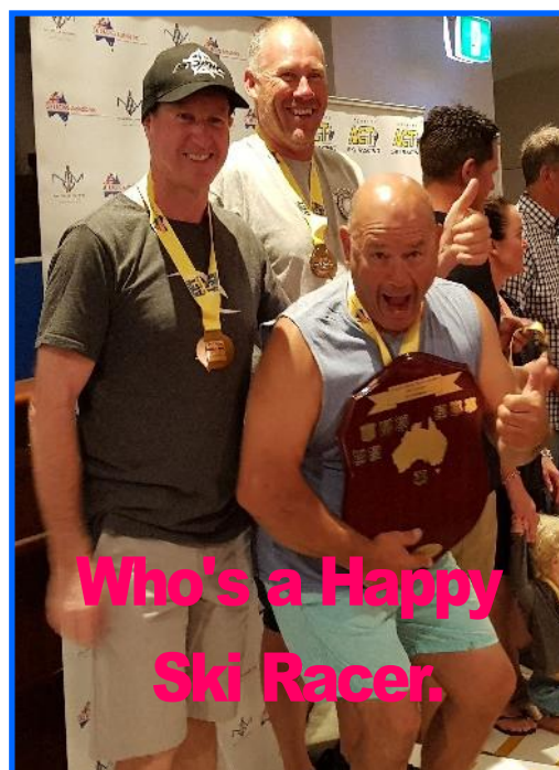
Who's a Happy Ski Racer.