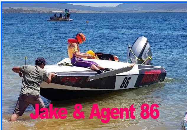
Jake & Agent 86