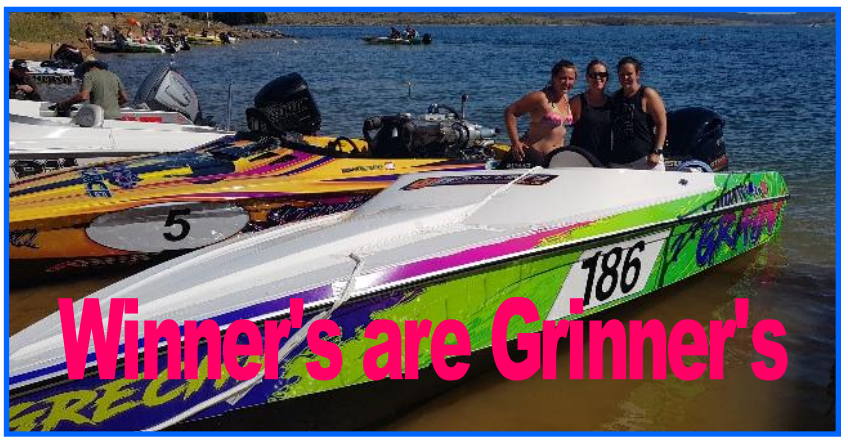
Winner's are Grinner's