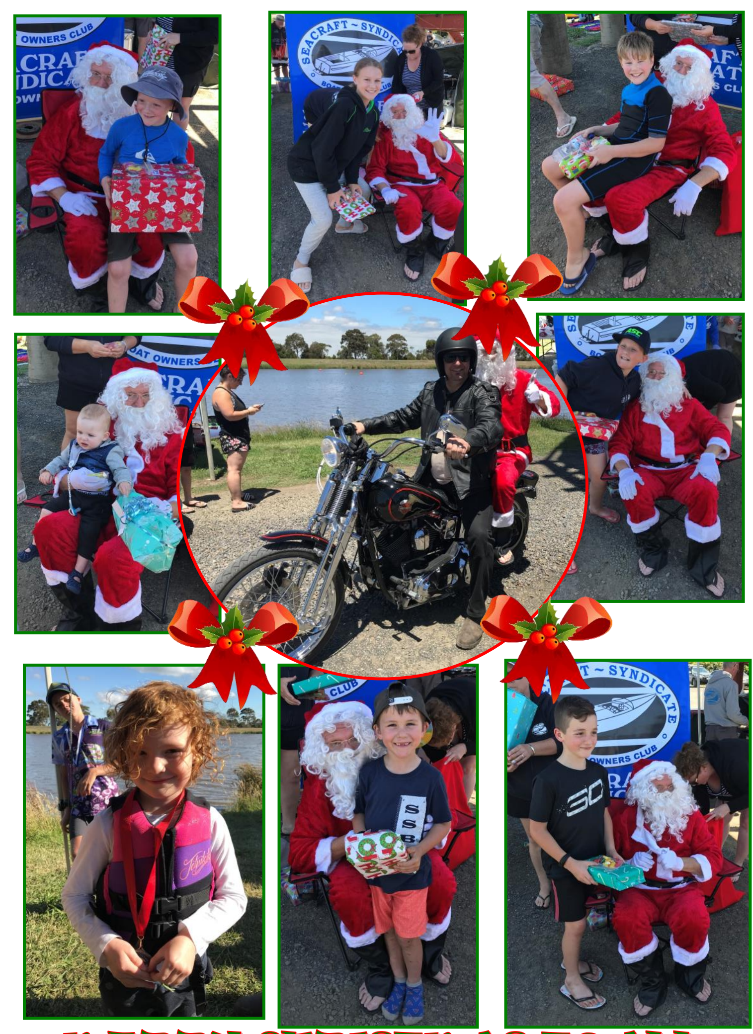
merry christmas to all