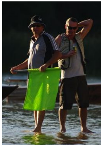
A suspect pair.