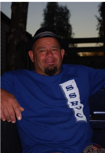
A relaxed Ex. Prez.

THE ABOVE RULES ARE FOR A TRIAL PERIOD AND ARE SUBJECT TO CHANGE AT THE DISCRESSION OF THE COMMITTEE AND CLERKS OF COURSE.