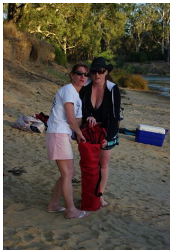
Here's a lovely Pair.