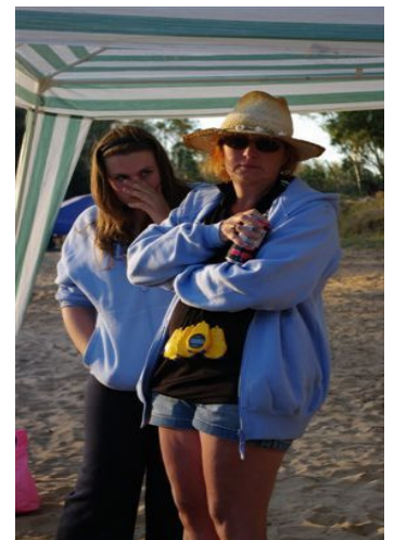
Must be time for a drink